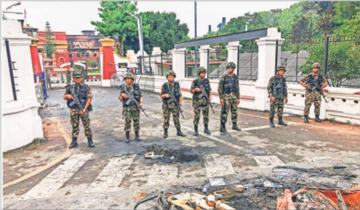
Security personnel stand guard at Nepali Rashtrapati Bhawan, which was vandalised and set on fire by protesters during the anti-corruption protest, in Kathmandu on Wednesday

In March this year, General Sigdel is said to have warned Oli not to arrest former King Gyanendra Shah or place him