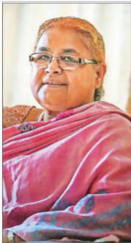
Former Nepal Chief Justice Sushila Karki